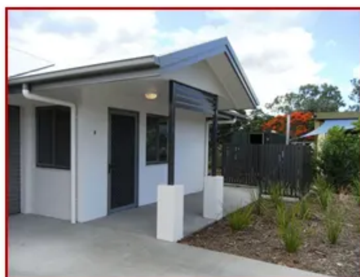
Disability designed units