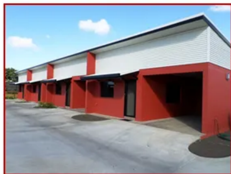
Affordable housing units